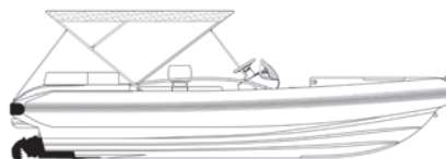
Bimini top with weather curtain set